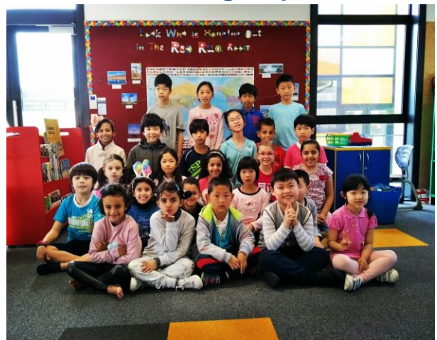
International students group photo - May 2019